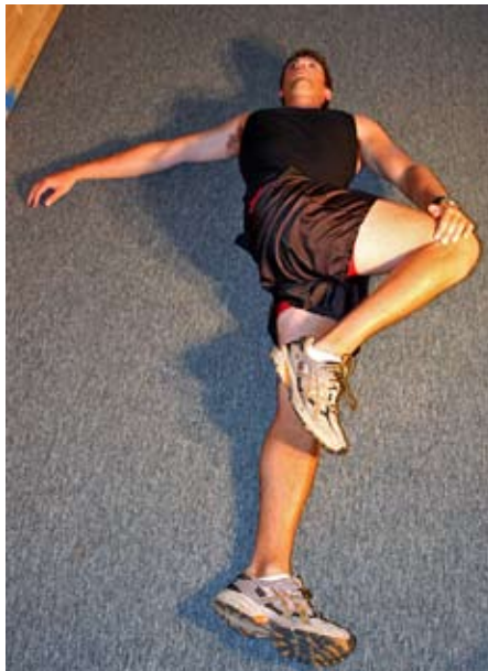
11. Low back. Lay on your back. Bring one knee up so your leg makes a 90 degree angle. Twist at the waist, and try to reach to the floor on your other side with your knee as you keep your shoulders down on the floor.