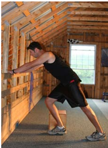
6. Calves 2. Front leg bent, back leg straight, heel on the ground. Push against the wall.