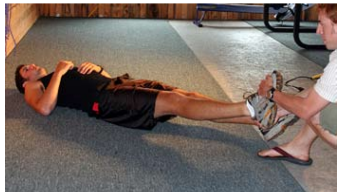
13. Partner Calf stretch. As you partner lays down on the floor, fully relaxed. Grip one of the ankles, one palm under one above, creating a loose grip around it. Use your weight to pull back for a few sec.