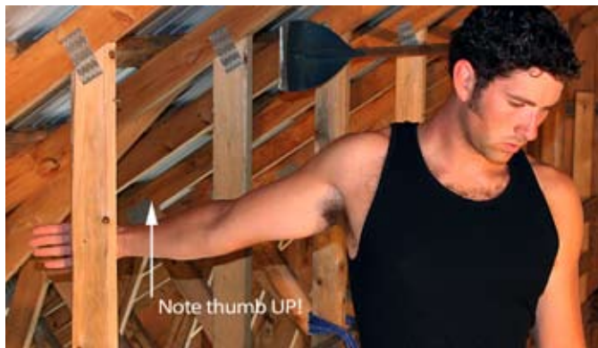
7. Upper arm. Use something for a stopper - like a pole or wall. Arm straight, palm into the wall or toward the pole. Twist your body away from your arm. Turn your palm over and repeat the stretch.