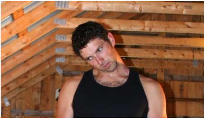
9. Neck. Relax your shoulders. Lean your head to the side, pull up and forward at the same time.