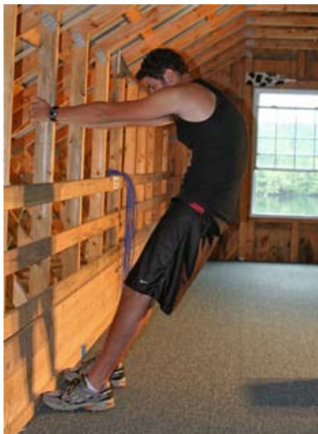
8. Mid-back/lats. Hold a pole, relaxed arms crossed one over the other, with your feet close to the wall, back arched forward. As you keep your arms fully relaxed, move your hips up and forward till you feel the stretch.